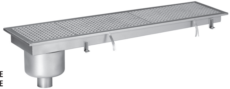
FLOOR GRID / WITH COLLECTING POT / DISCHARGE FROM THE BOTTOM / INCLINED TO ONE SIDE