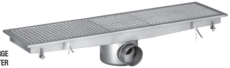
FLOOR GRID / WITH COLLECTING POT / DISCHARGE FROM ONE SIDE / INCLINED TO THE CENTER